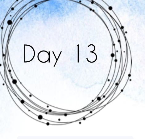
Bonus Trust and detach from the result.